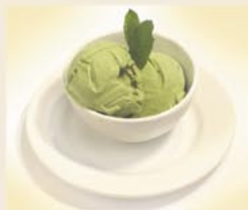
175. GREEN TEA ICE CREAM $2.95