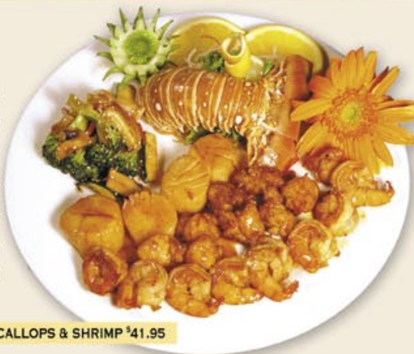
150. LOBSTER & SCALLOPS & SHRIMP $41.95